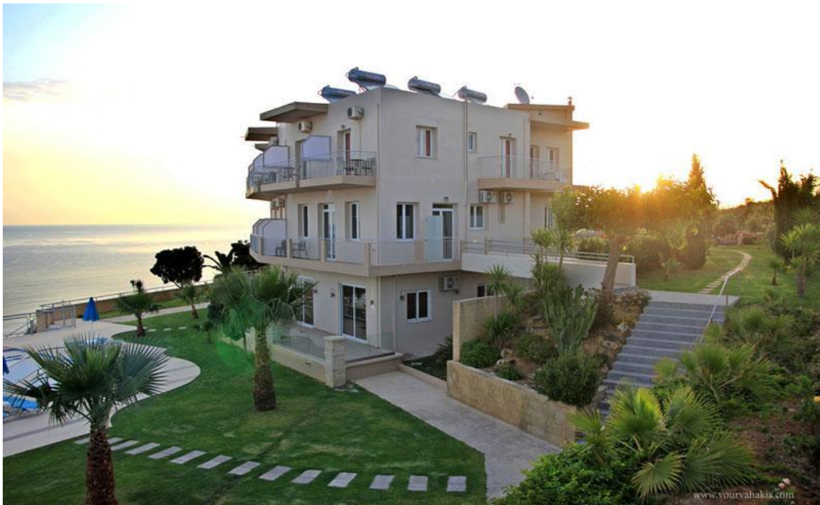
The Renieris Hotel

Our schedule will be spacious and will allow plenty of time for group bonding. Our group will be meeting outside by the garden and pool area. Atum will teach for around 3hrs in the morning. Contemplative exercises will be given to work on during the day. Most days we will meet again in the evening for a group sharing. We also plan on visiting a few churches, synagogues, and monasteries.